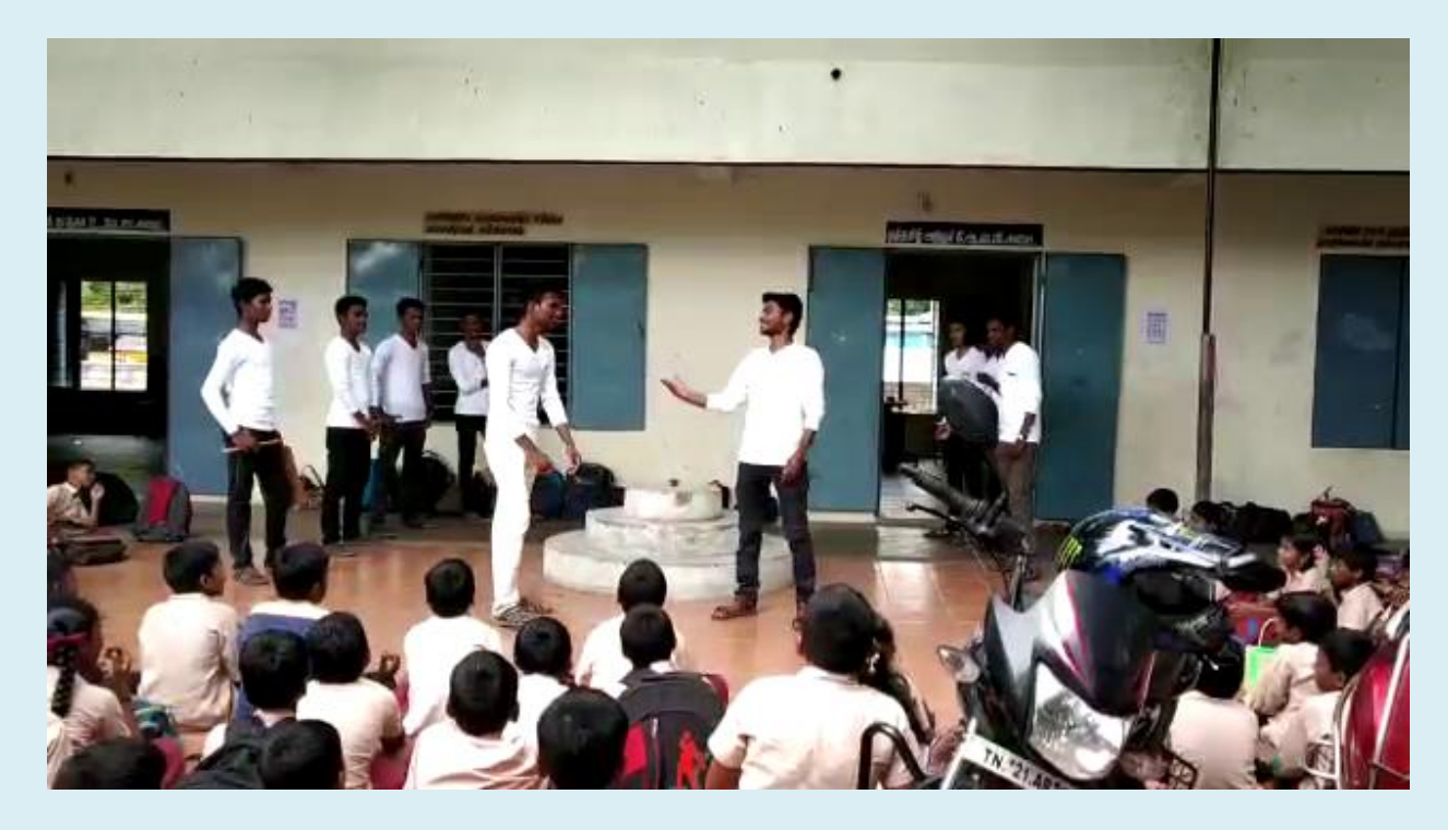
CREATING AWARENESS THROUGH STREET PLAY